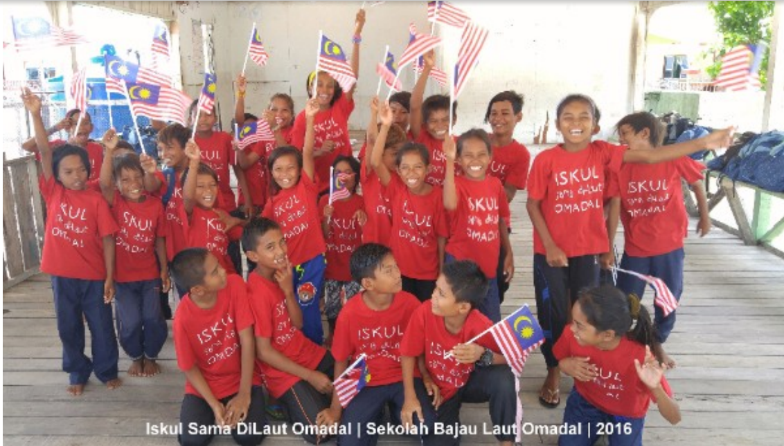
Iskul Sama Di Laut Omadal | Sekolah Bajau Laut Omadal | 2016