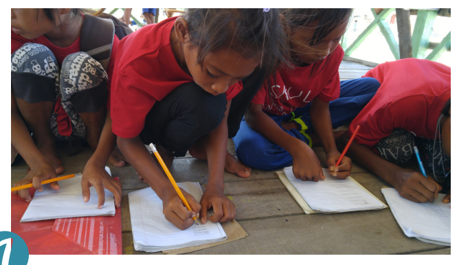
Development of stateless children Sponsor our student's school needs and meals.

Thanks to your generous investment and passionate support, 21 children were able to learn to read and write. As we grow, we hope that you will consider supporting crucial aspects needed to develop Iskul as follows: