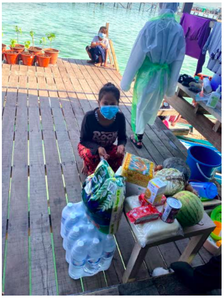
Photo 6: A recipient waited to collect her food basket at Pondok Iskul's extended platform. The extended platform was built with funds from Yayasan Hasanah Special Grant 2020.