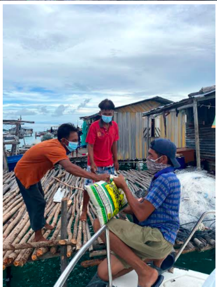
Photo 7: Semporna Heroes' crew helped us to pass a pack of rice to the stateless recipient. This was one of the days when we delivered food baskets straight to the recipients' house using Semporna Heroes' boat when they brought in the food supply from Semporna.