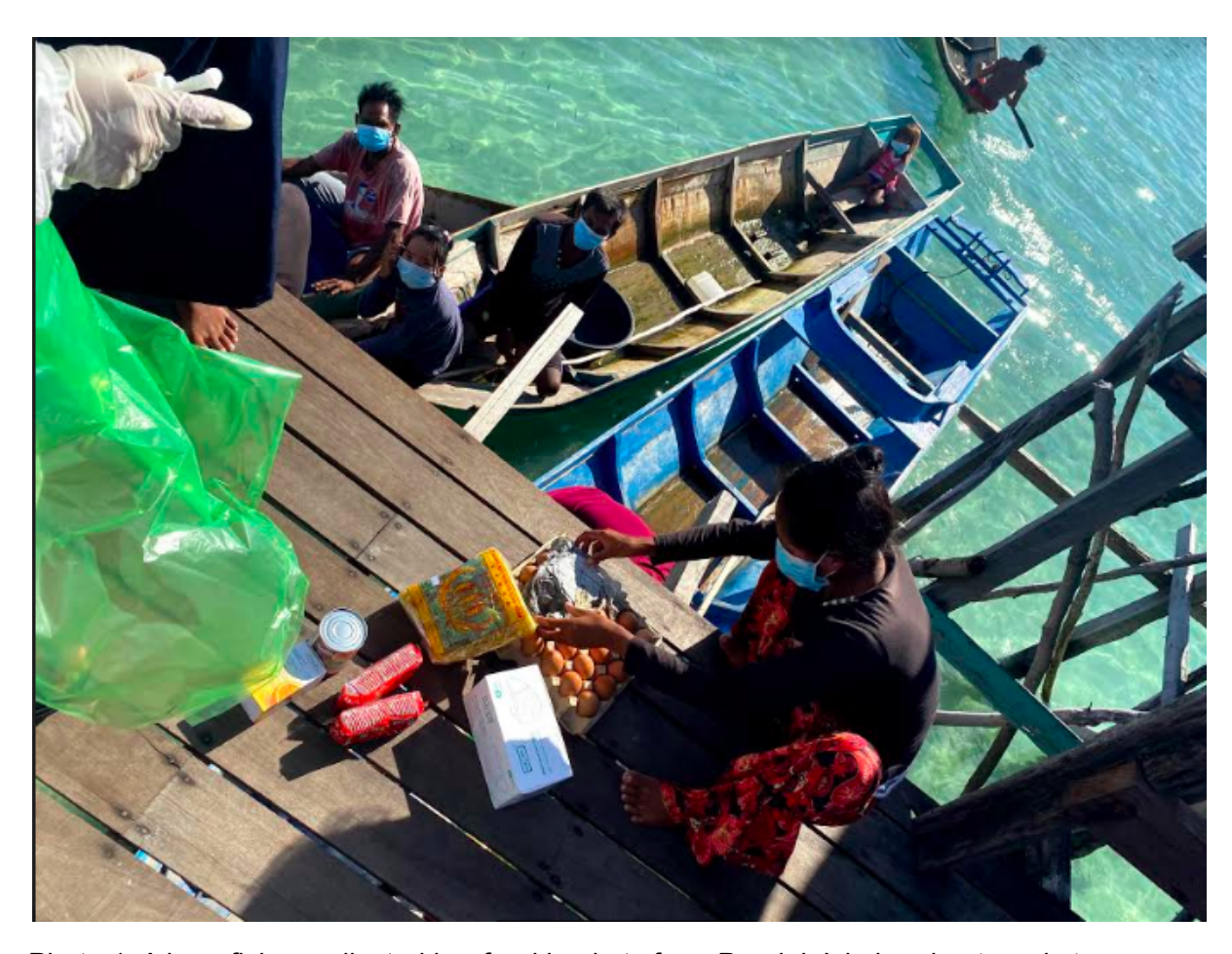
Photo 1: A beneficiary collected her food baskets from Pondok Iskul and got ready to transfer it into her small wooden boat, while others waited for their turn.