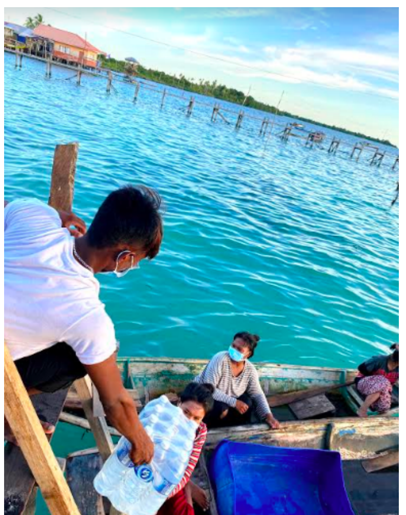
Photo 4: A recipient passed down a carton of drinking water to his family member to be kept in their wooden boat.