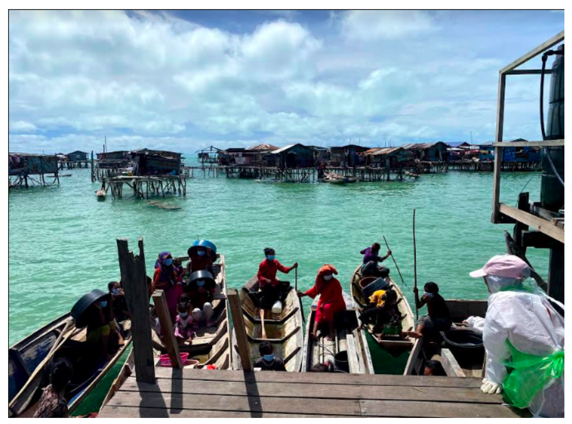
Photo 2: The stateless recipients waited at Pondok Iskul for their turn to collect their food basket from their wooden boat.