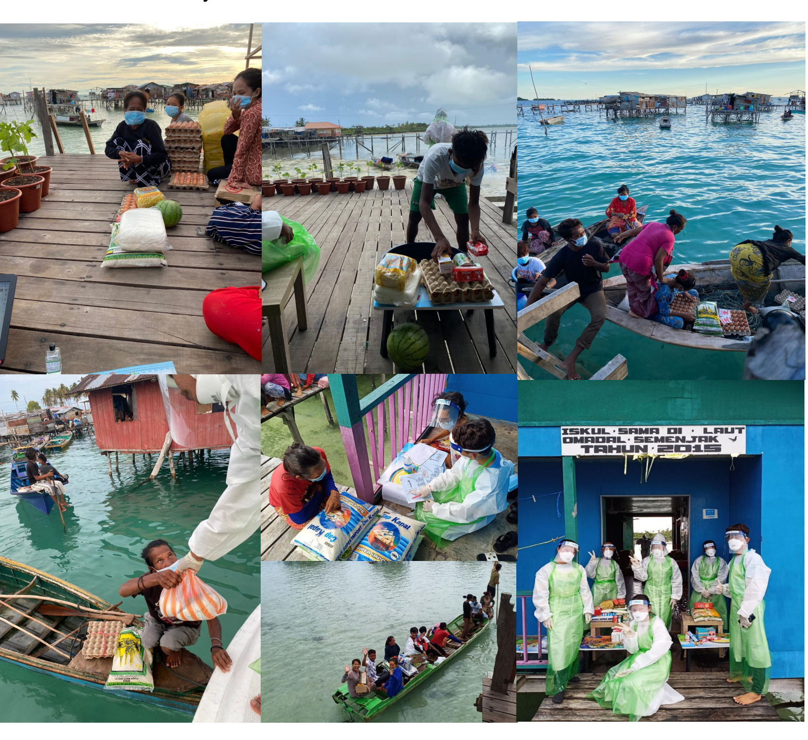
Yayasan Hasanah Humanitarian and Disaster Relief HRF 2020