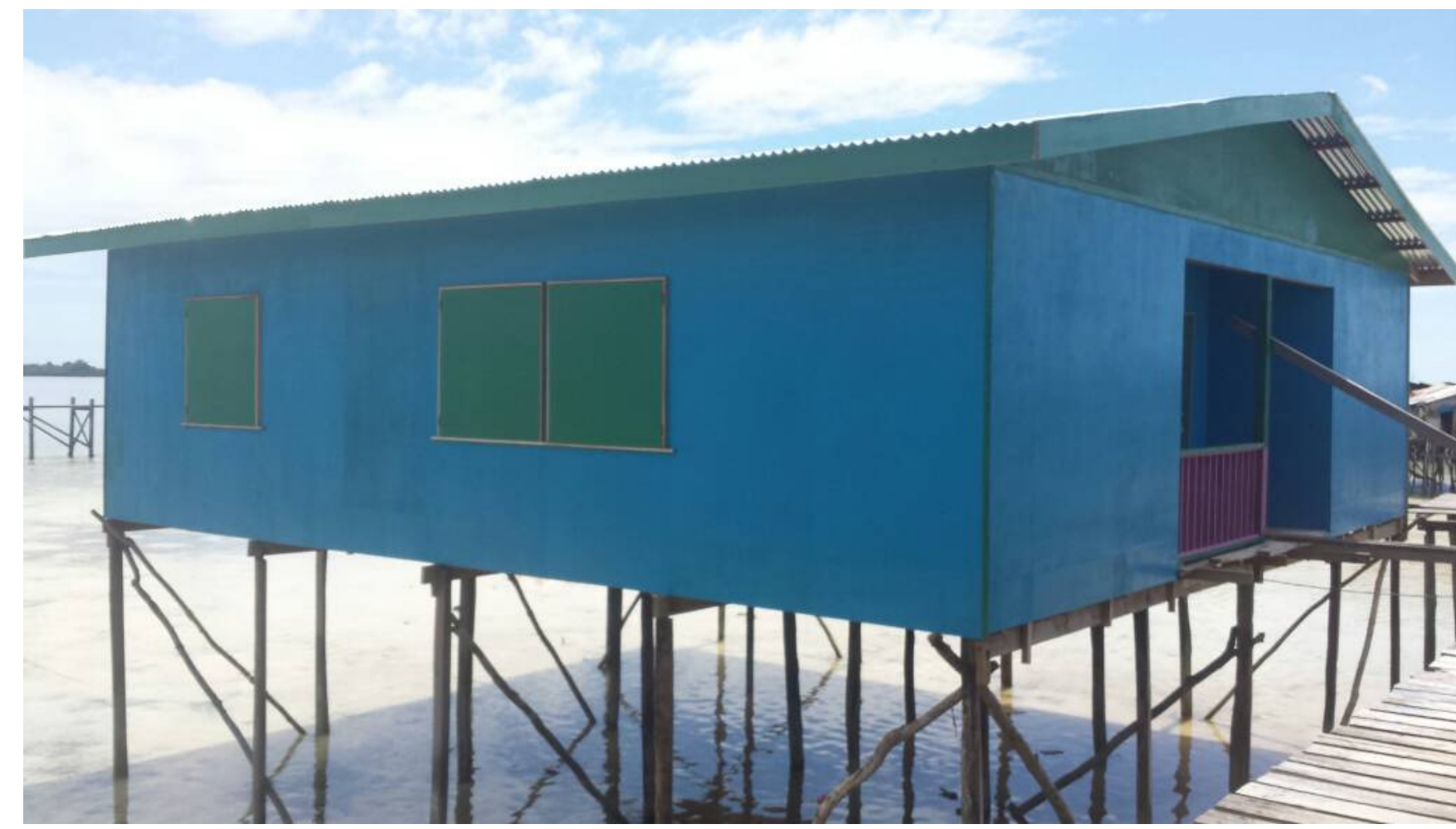
Pondok Iskul completed construction in February.