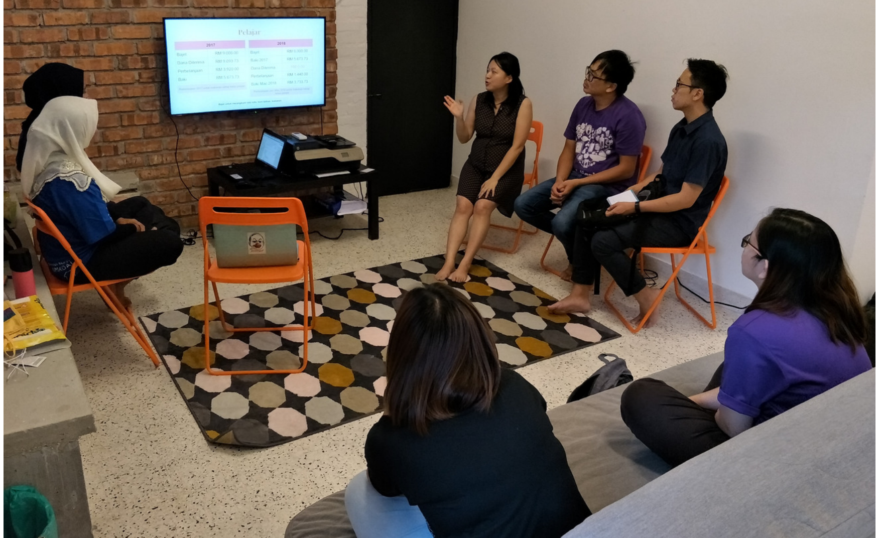
Iskul presented Iskul's strategic planning meeting outputs including milestones, challenges, planned activities for the coming years 2018/2019