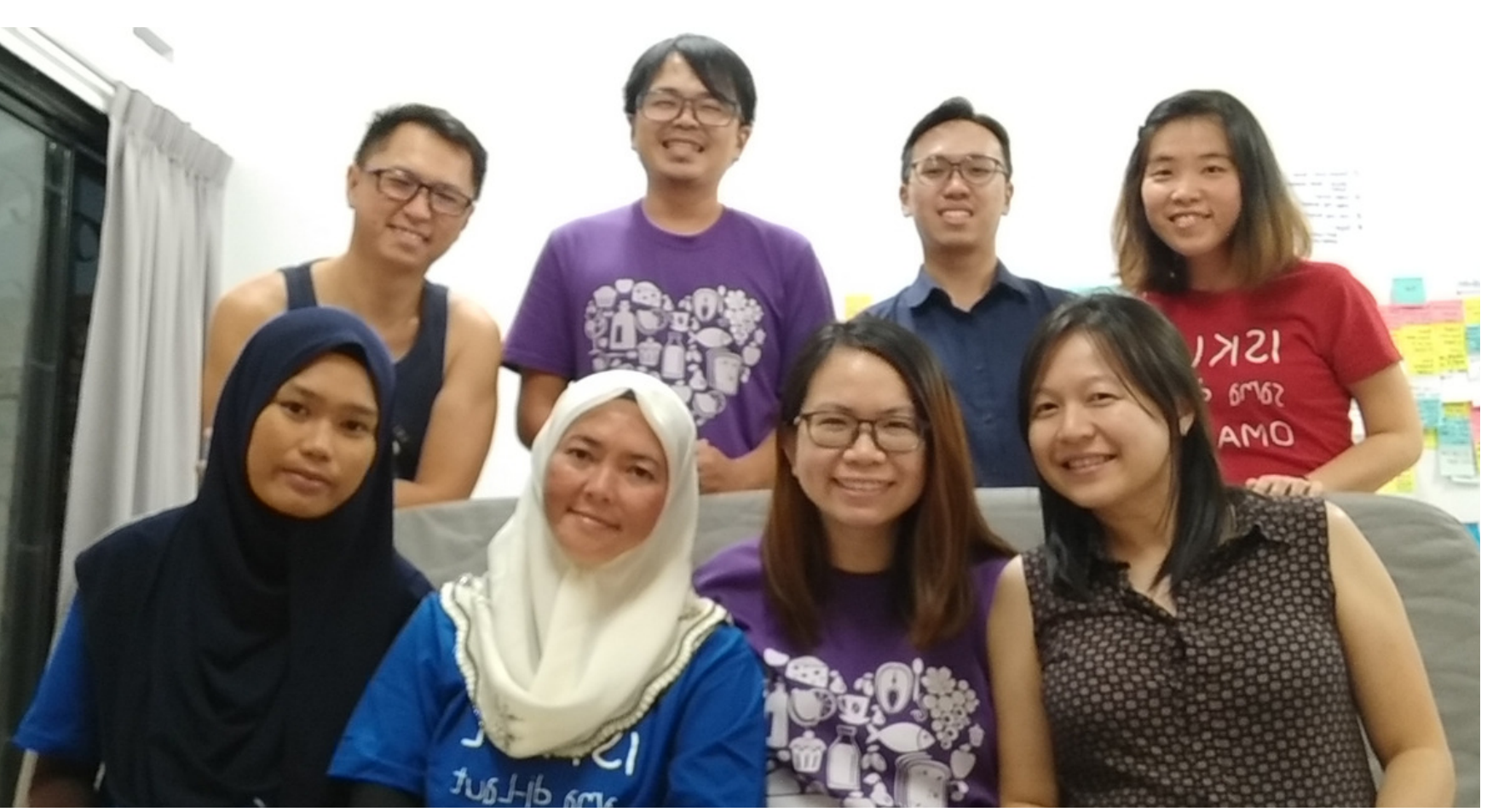
Iskul completed its first Annual General Meeting (AGM) with attendance from our advisors, donors, Headmistress and Field Coordinator.