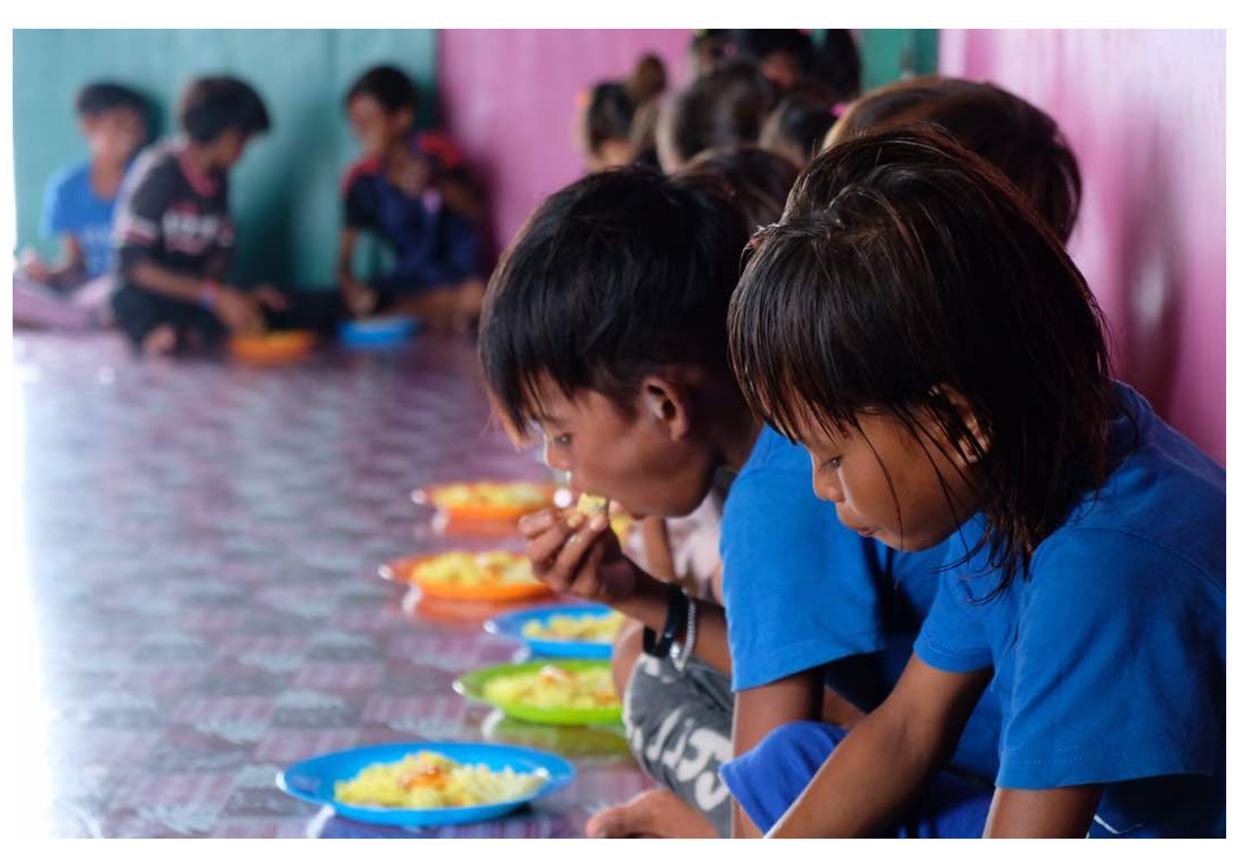
Students enjoying their meals after classes in Pondok Iskul.